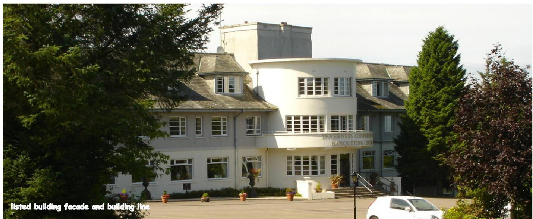
listed building facade and building line

G H Johnston Building Consultants Ltd, Willow House, Stoneyfield Business Park, Inverness IV2 7PA Tel: 01463 237229 Fax: 01463 243258 www.ghjohnston.com .